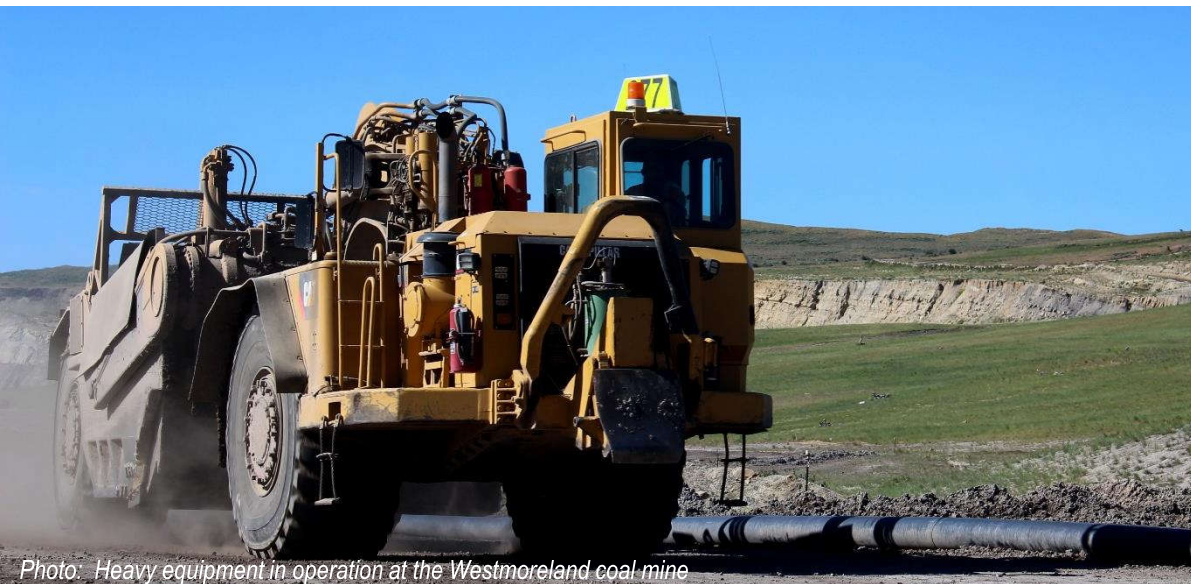
Photo: Heavy equipment in operation at the Westmoreland coal mine