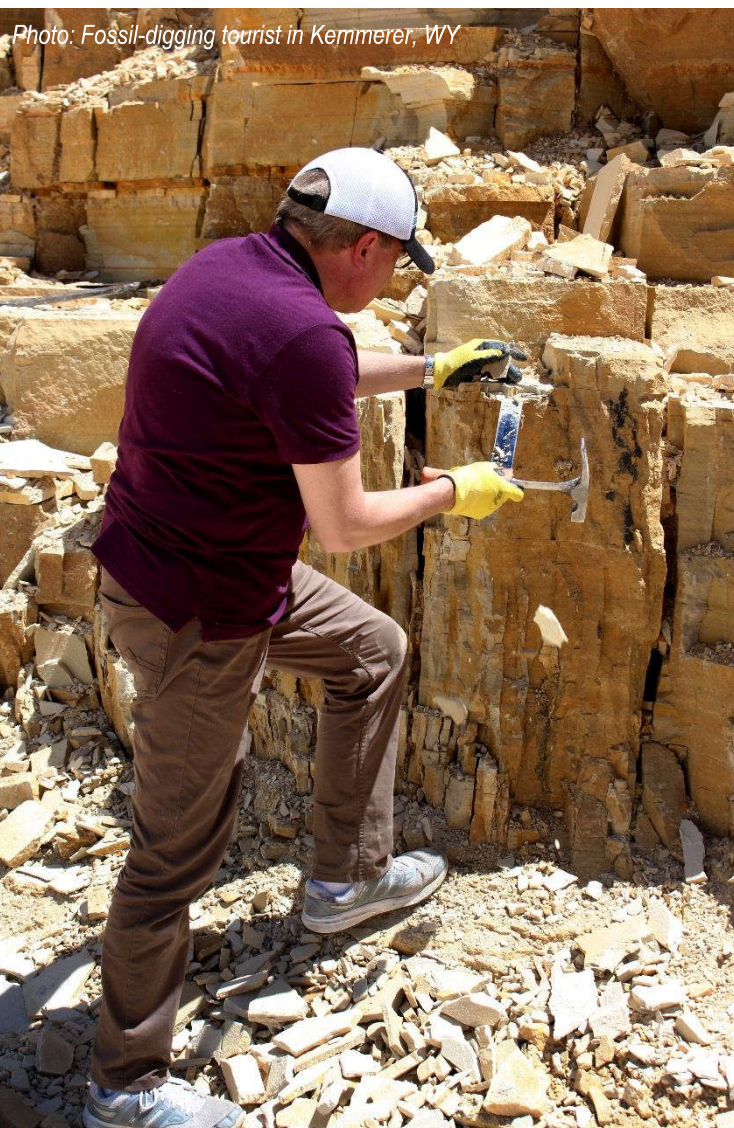
Photo: Fossil-digging tourist in Kemmerer, WY

The city administrator will find Kemmerer to be a community that embraces someone who isn't afraid to “roll up their sleeves” in any capacity.